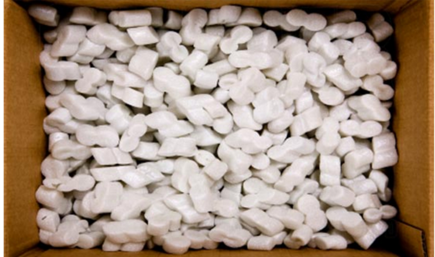
Styrofoam peanuts

There are polystyrene peanuts and an eco-friendly starch based version, which one can use to provide cushioning. Super-light, durable, reusable and recyclable are basic features of foam balls that have been used to protect fragile products from many years.