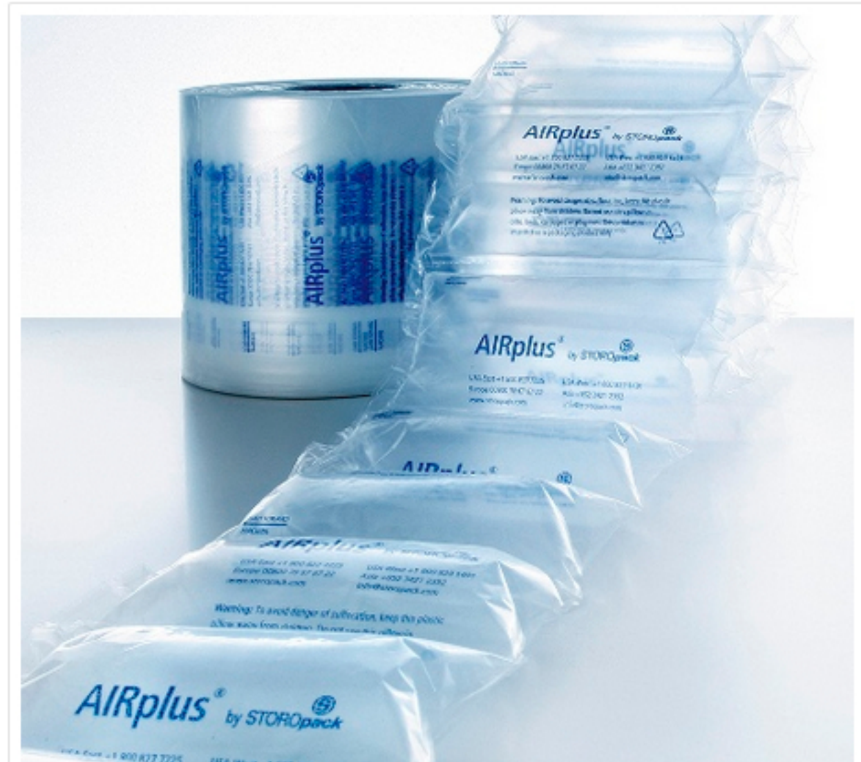
Air Cushions

Air filled pillow bags help in filling empty spaces, block & bracing, and wrapping products. Available in various sizes and shapes, they are said to be great shock absorbers, reliable and durable. Depending on the quality, air pillows can be puncture resistant, ecological and recyclable. Being lightweight makes it economical as you can save on shipping costs.