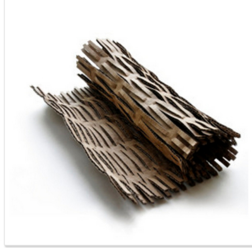
Corrugated Bubble

With rising focus on making our planet green, many prefer environment friendly material such as recycled corrugated wraps. It is touted as biodegradable alternative to bubblewrap and peanuts. Although you will have to opt for totally thick paper wraps with heavy padding to protect extremely fragile products. But they offer effective scratch protection to products made from glass, metal, and ceramic.