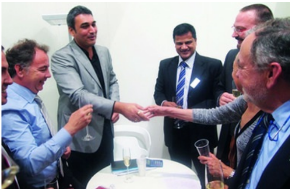
Dynaflex invests in new technology as it enjoys the challenge of complex jobs

Carrier bag and security printer Dynaflex has ordered a second flexo press from Comexi.